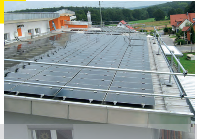
Solar builders can rely on this: free roof surfaces and highest levels of safety from SIFATEC.