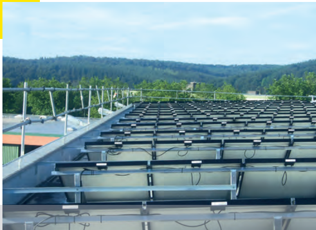
A configuration up to close to the roof edge is possible.

Thus you can concentrate on your work and we take care of safety.