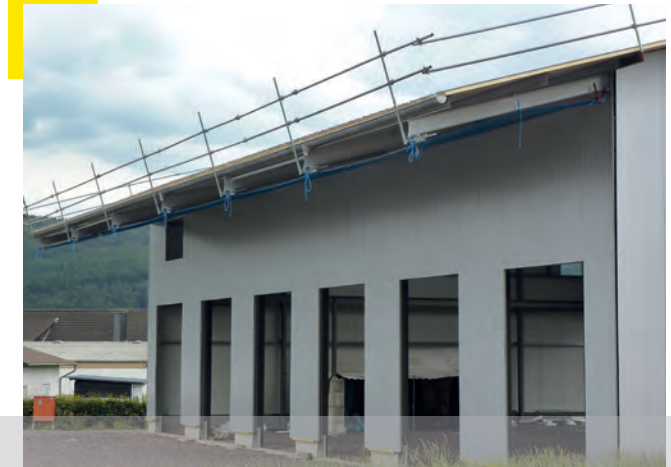
Safety, as required by the German Building Trade Association (Bau-BG).