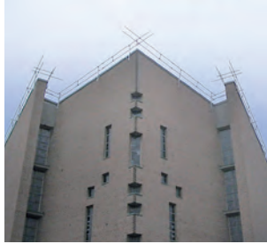
The patented SIFATEC Scaffolding system knows almost no bounds. Neither amount nor length.

There are many challenges in the field of roofing. But the issue of safety should always have priority, regardless of how the building site is set up. With the patented SIFATEC flat roof guardrail every building site is quickly and safely fitted out.