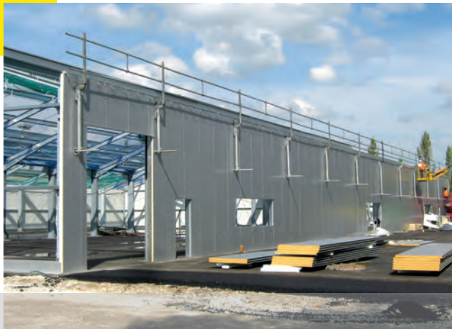
Simple and efficient: the SIFATEC scaffolding system.